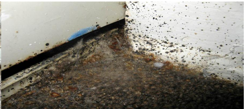
Figure 4 Bed bug hiding place where carpet meets wall