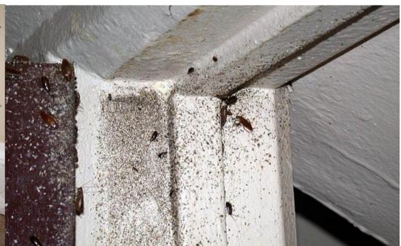
Figure 2 Cockroaches and frass in a doorframe