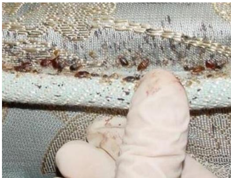
Figure 3 Bedbugs on mattress